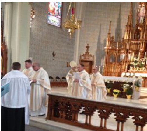
The celebration of the Eucharist with Bishop LeVoir as Main Celebrant and the priests in attendance concelebrating.